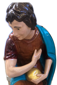
A shepherd boy

The work already done includes the Baby Jesus. He is no longer missing half a hand. And additionally, the shepherd's foot is back in one piece.