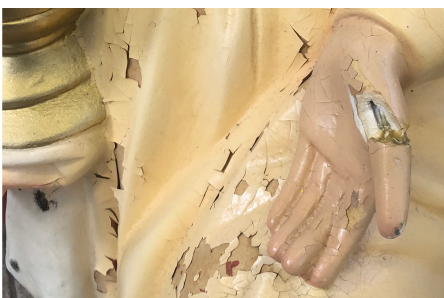
The Hand of a King